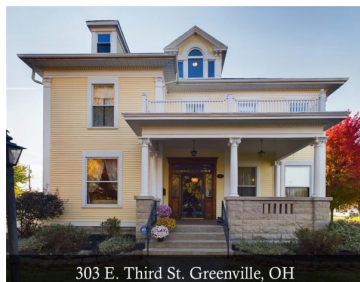
303 E. Third St. Greenville, OH